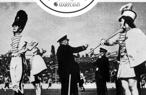
Coed Drum Majors' Shorts Too Short!

In the meantime, today's members are giving spirited performances here and around the world. In July, the Community Band performed a salute to the 2008 Olympics in Shanghai and Beijing, China, prior to the Olympic Games. Take a look at other historically and culturally significant moments from 100 years of Maryland music. —CW