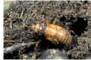
Cicada nymph emerging from soil

burrow into the soil and feed on the sap of tree roots for the next seventeen years. During the spring of their last year, the nymphs tunnel to the soil surface and emerge. Eventually they crawl onto tree trunks, posts and other upright structures and after a short period shed their skin to become winged adults. The empty skins are left clinging to objects.