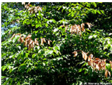
Damage to tree from egg-laying

A week after emergence, the adults mate and the females deposit eggs in groups on twigs near the end of branches of more than 200 kinds of trees. The eggs hatch in about six weeks. The young or nymphs drop to the ground where they